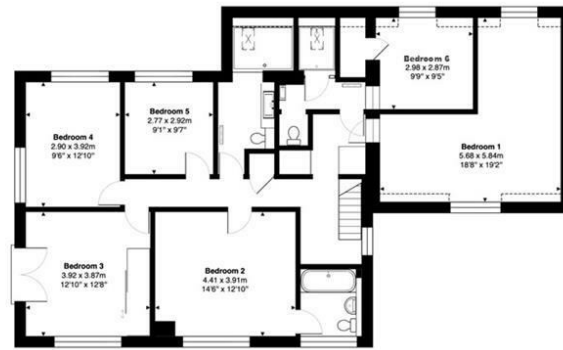
First Floor Gross Internal Area: 128.5 m 2 ... 1383 ft 2